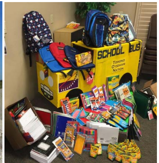
(Above) Some of our ministries to the Tohono O'odham Reservation. (Left) The beginning of the church construction in San Marcos, Mexico